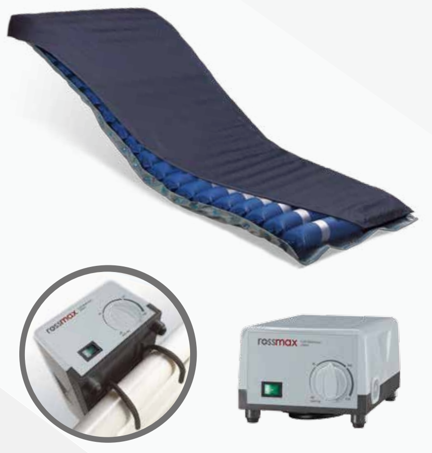
Adjustable hangers to suit any kind of hospital bed frame